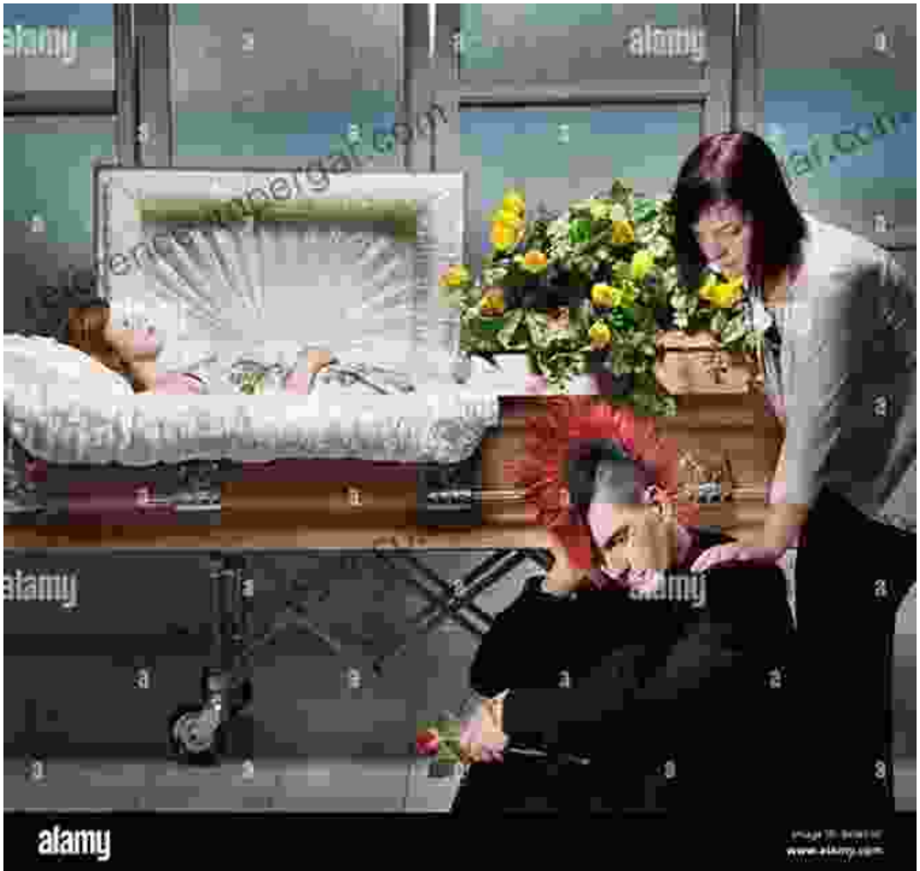
Women mourn the death of a loved one in the aftermath of a suicide bombing in Kabul.