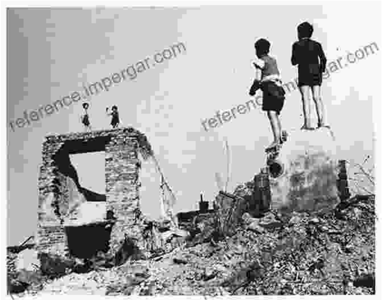
Children play in the ruins of their home in Sarajevo.