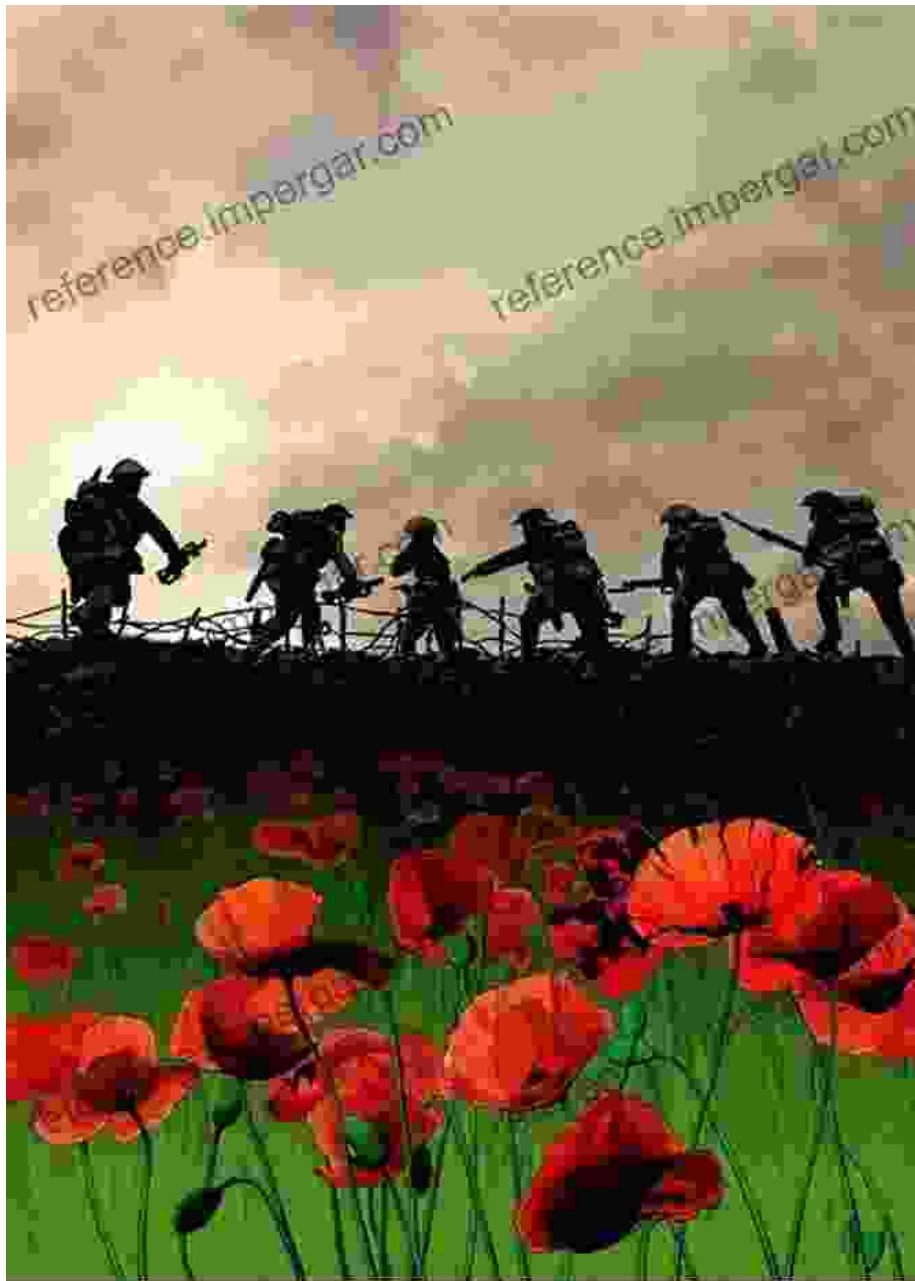
Soldiers walk through a field of poppies in Afghanistan.