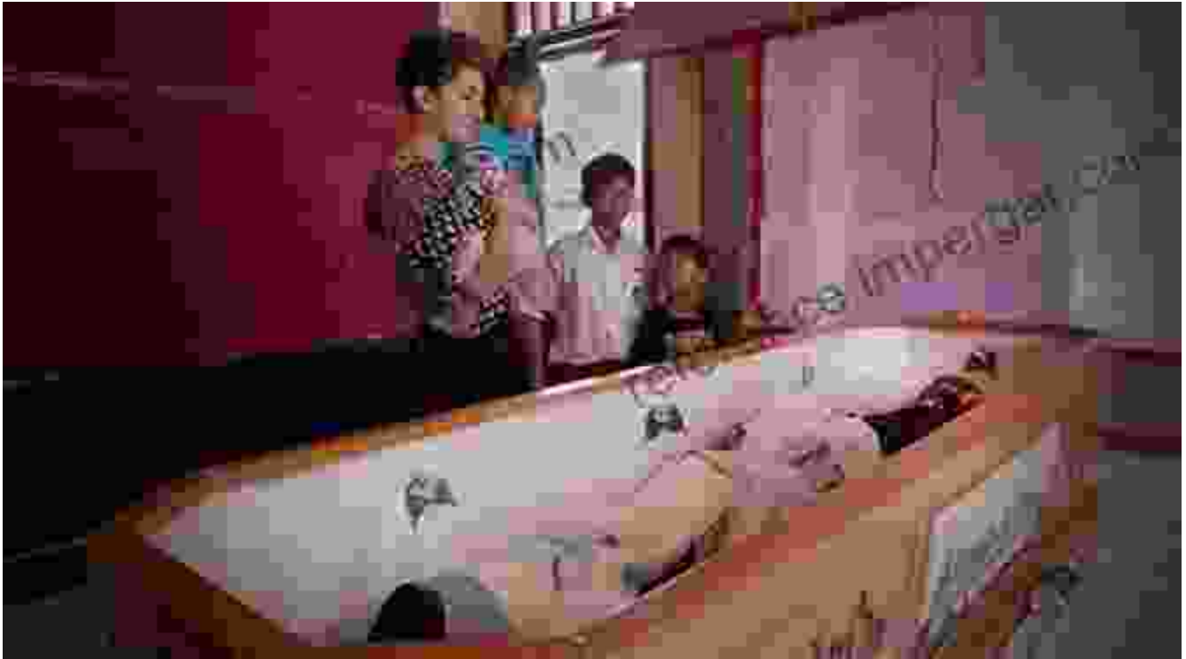
A young girl stands next to the body of her brother in the aftermath of a car bombing in Baghdad.